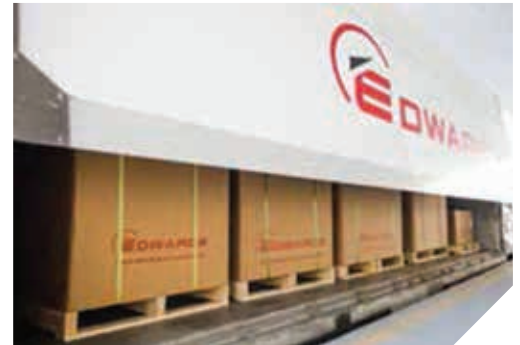
Regularly updated stock