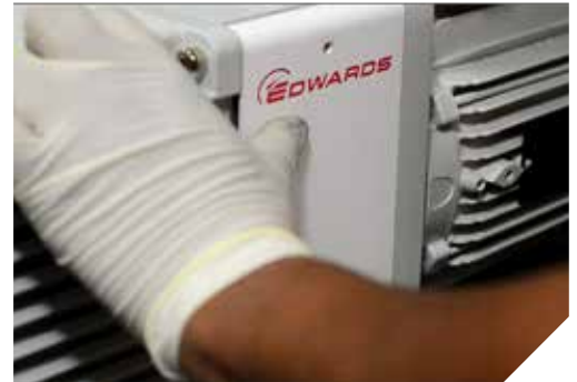
Every detail cared for