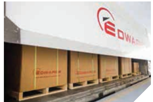
Regularly updated stock