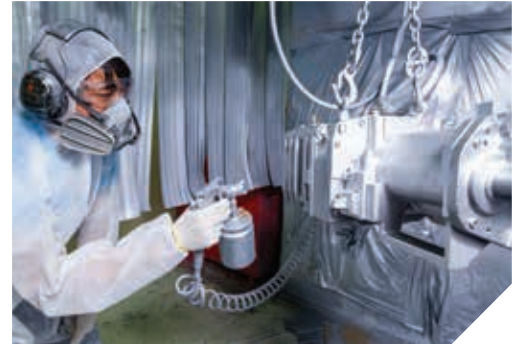
Refurbished inside and out