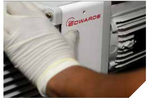
Every detail cared for